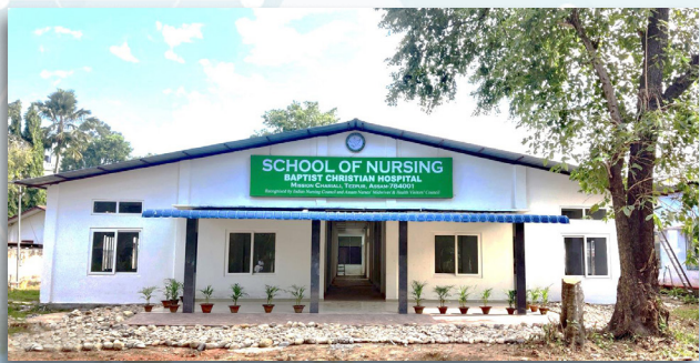
Left: Current BCH School of Nursing Below: Future College of Nursing and Training Center